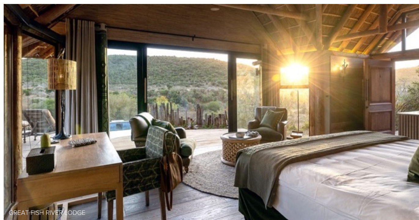
GREAT FISH RIVER LODGE